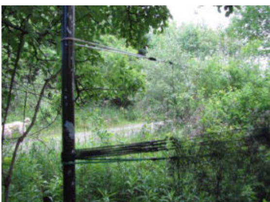
The top panel up, ready to furl..

to keep the net closed. Not too difficult to open after undoing all the ties and finding a place to put them. The place was everything from just dropping them to putting them under an end tether.